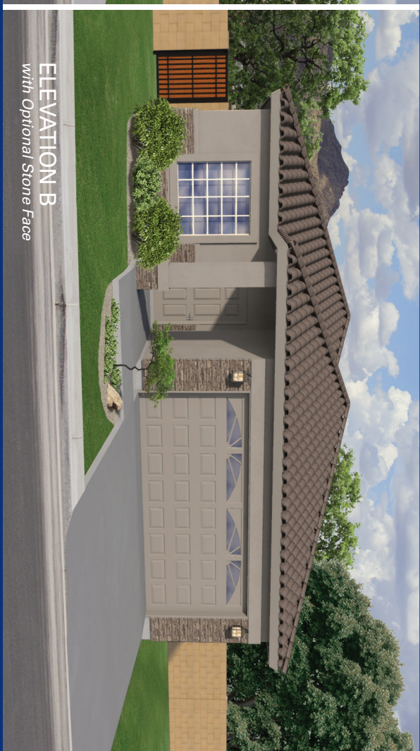
ELEVATION B with Optional Stone Face