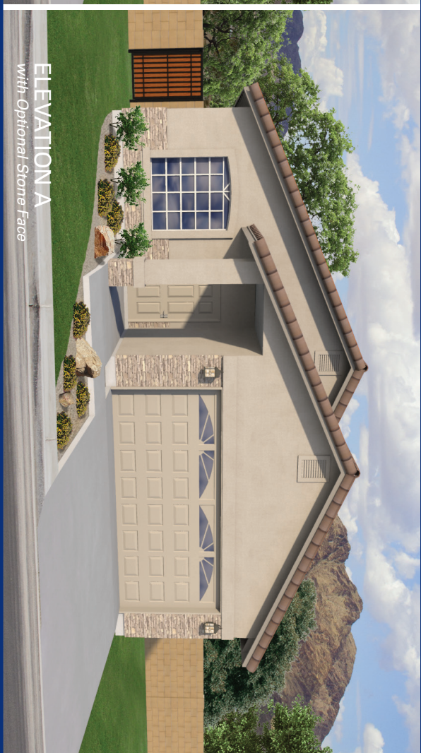
ELEVATION A with Optional Stone Face