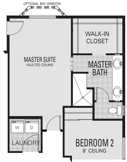
OPTIONAL 3 BEDROOM / EXTENDED MASTER SUITE